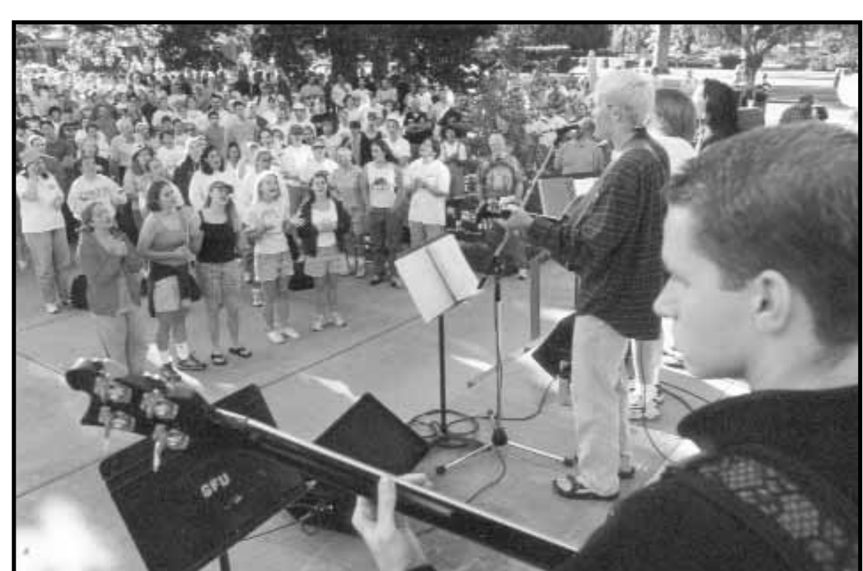
A massive crowd of students, faculty and staff filled the campus quad as George Fox University's chapel band opened Serve Day with praise and worship songs.